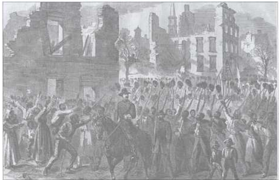
This scene of the 55th Massachusetts Colored Regiment marching in Charleston, South Carolina appeared in the March 18, 1865 Harper's Weekly.

"Let the conflict begin." Frederick Douglass, March, 1861